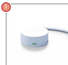
UNO Controller 110 000 010