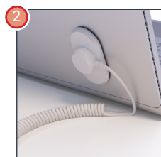
Roto Sensor 120 000 810