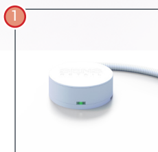
UNO Controller 110 000 010