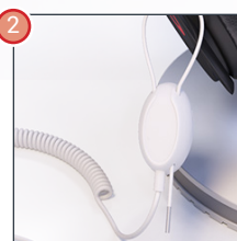
Loop Sensor SD335-T/W