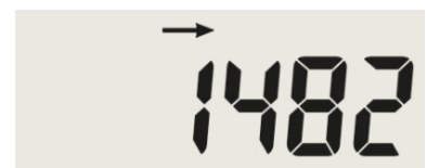
Second direction count