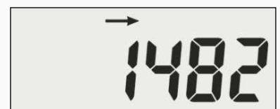
Second direction count