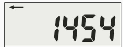
First direction count